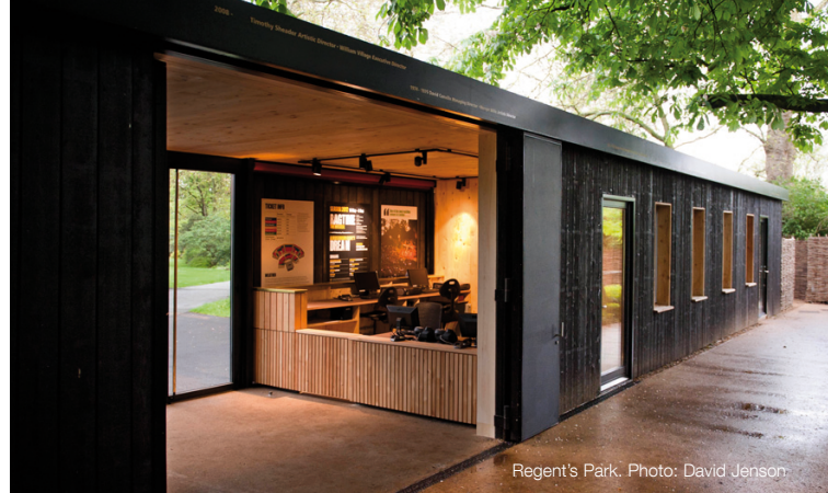
Regent's Park.