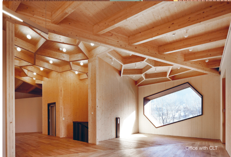
Office with CLT