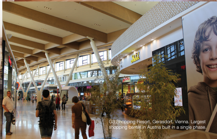
G3 Shopping Resort, Gerasdorf, Vienna. Largest shopping centre in Austria built in a single phase.